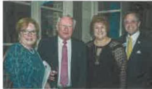
Agnes welcomes some of our generous supporters