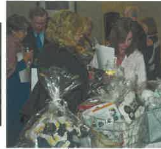
Lots of bidders at the Silent Auction