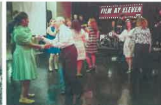
Dancing to the band "Film at Eleven"