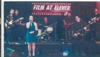
And the band played on