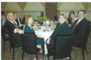
Lakewood Country Club served a delicious meal