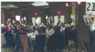
Bidding War over the Live Auction prizes