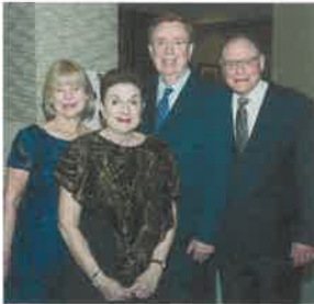
Councilmembers, former Rockville Mayor, & Clinic namesake