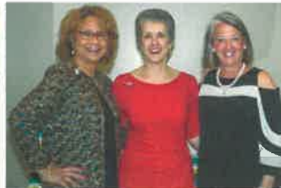
First Lady, State Senator, Mayor