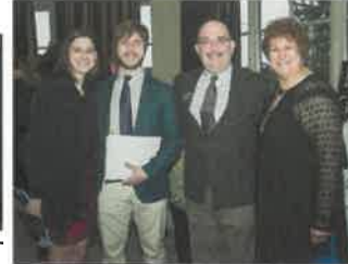
A number of candidates attended the reception