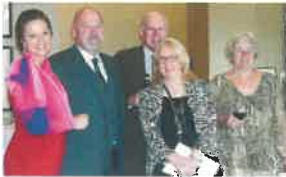
The reception offered a chance to bid while seeing friends!